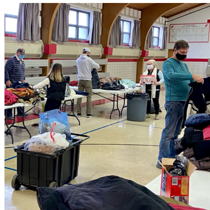
Above: Parishioners sort and bag coats collected at our coat drive.