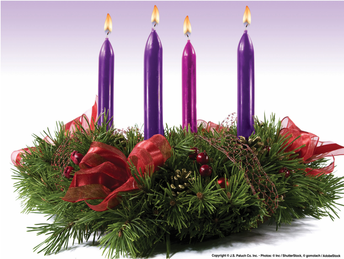
Copyright © J.S. Paluch Co. Inc. Excerpts from the Lectionary for Mass © 2001, 1998, 1997, 1986, 1970, CCD.