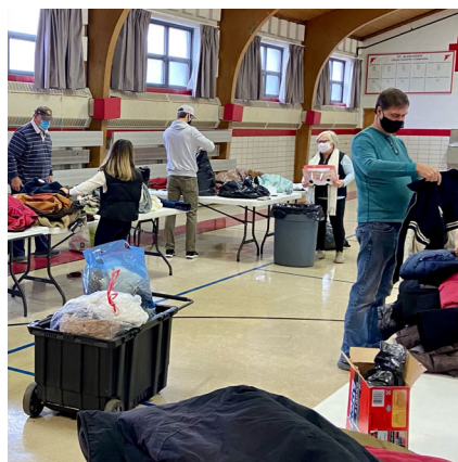
Above: Parishioners sort and bag coats collected at our coat drive.

For St. Alexander News and Faith Enrichment follow us on: