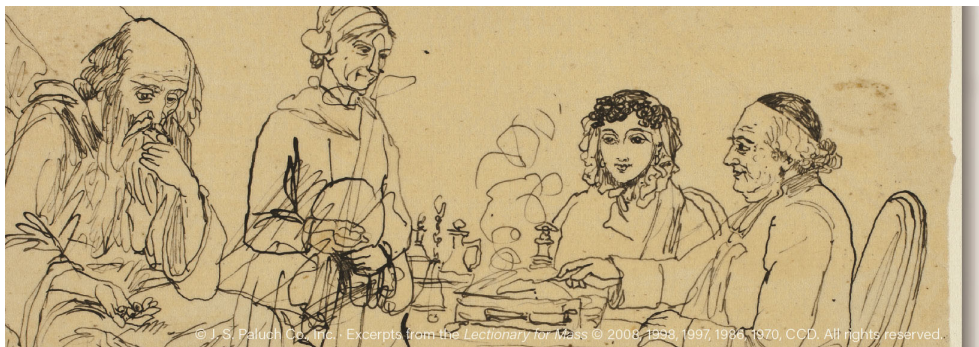
Alms to the Poor n.d. Rodolphe Bresdin French, 1825–1885 Art Institute of Chicago