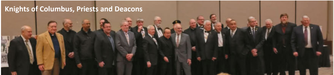
Knights of Columbus, Priests and Deacons