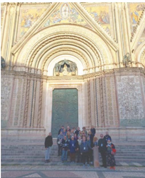
Our Holy Pilgrim Tour at the Cathedral of Orvieto, Italy (Orvieto Duomo). At this site is housed a Eucharistic Miracle from 1263.