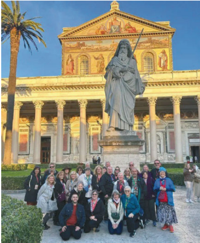
"Papal Basilica of Saint Paul Outside the Walls", Rome, about to visit the tomb of Saint Paul. The sunset certainly worked in our favor! Martyrs are commonly depicted with the means of their martyrdom, in Paul's case, the sword".