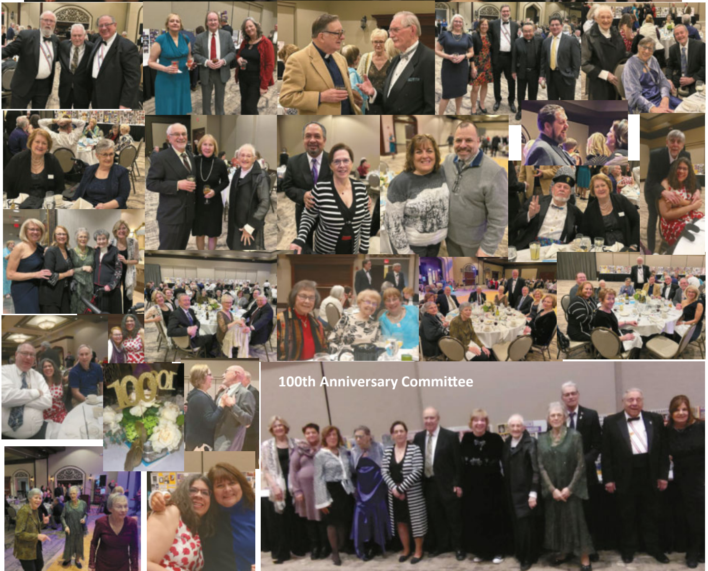
100th Anniversary Committee